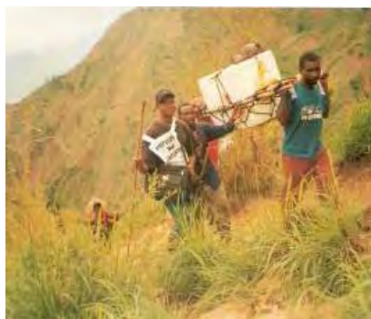
SANRU Map and Photos

A key objective of Project AXxes is to increase access to, demand for, and quality of health care services. This has included training more than 23,000 health care workers and rehabilitating some 200 health facilities. It has also included providing commodities to 57 health zones in some of the most rural and isolated areas of Congo. The challenges are daunting -- reams of custom regulations, lack of roads, weak bridges, areas of insecurity, and much more.