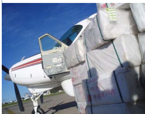
Below: Loading a MAF plane in Lubumbashi

Tuberculosis is a resurgent and growing epidemic in parts of DR Congo. Last year an alarming number of cases were detected in a cluster of AXxes-assisted health zones in remote central Katanga province (see map). With support provided by Project AXxes several thousand were screened and over 1500 were found to be positive for TB. Unfortunately none had access to treatment.